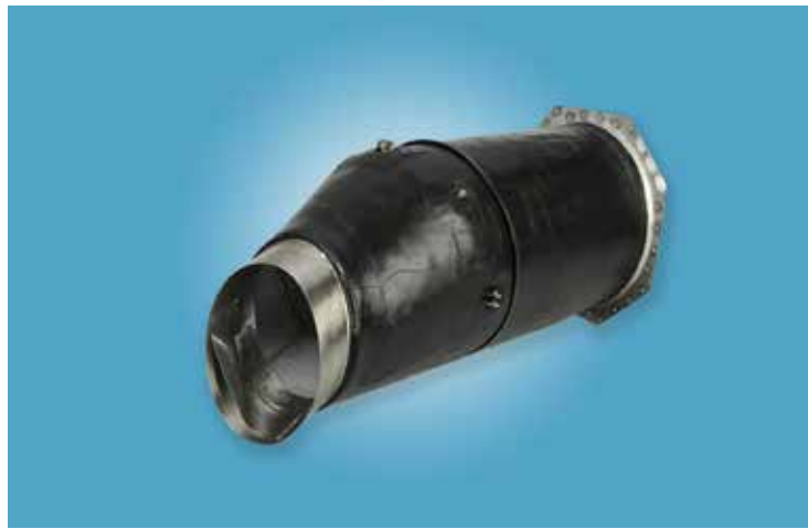
Inlet & Exhaust Ducting