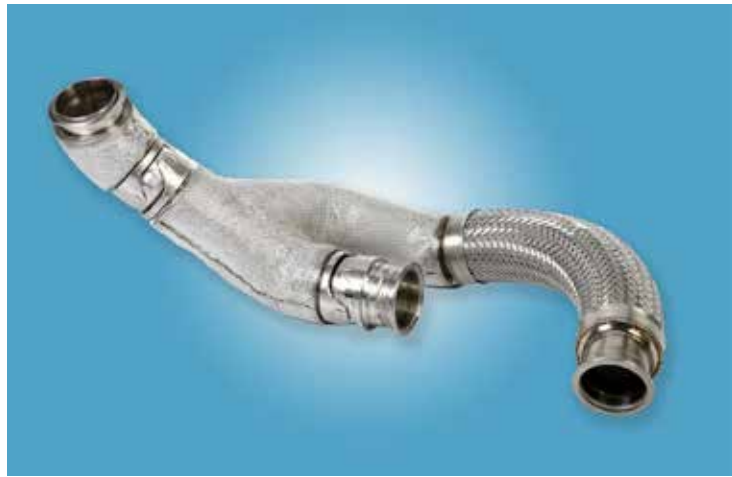
High Pressure Ducting