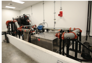
Universal Fuel Flow Test Stand