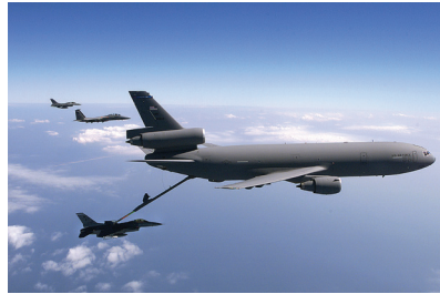
KC-10 refuels a joint-flight of F-15s and F-16s