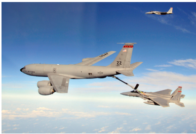
KC-135 refuels an F-15

The Fuel Flow Transmitter functions as the primary source of accurate fuel flow measurement during KC-135 and KC-10 in-flight refueling activities.