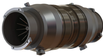
Fuel Flow Transmitter