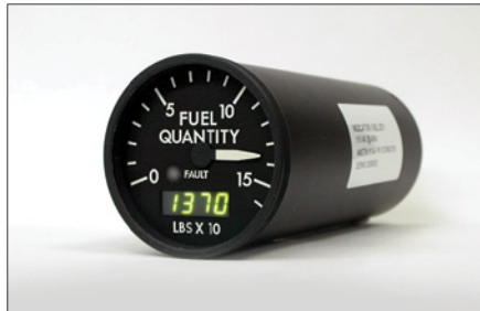
Fuel Quantity Indicator