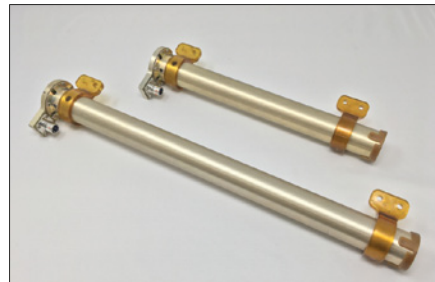
Fuel Quantity Probe